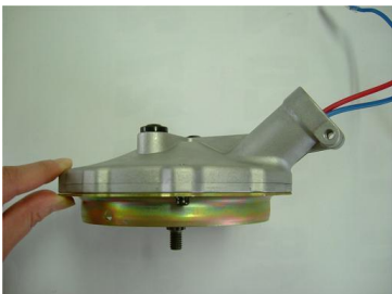
For general use